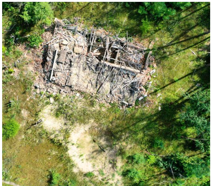
Aerial view taken by a drone showcasing a damaged building during non-technical survey (July 2023).