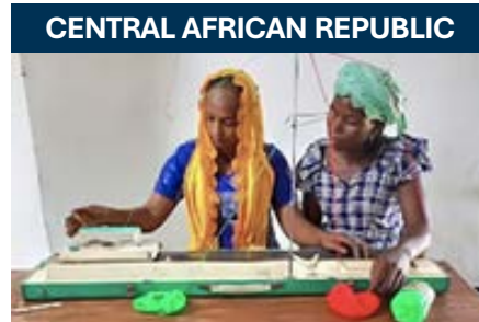
CENTRAL AFRICAN REPUBLIC

Mine clearance · Explosive ordnance risk education · Mine victim assistance