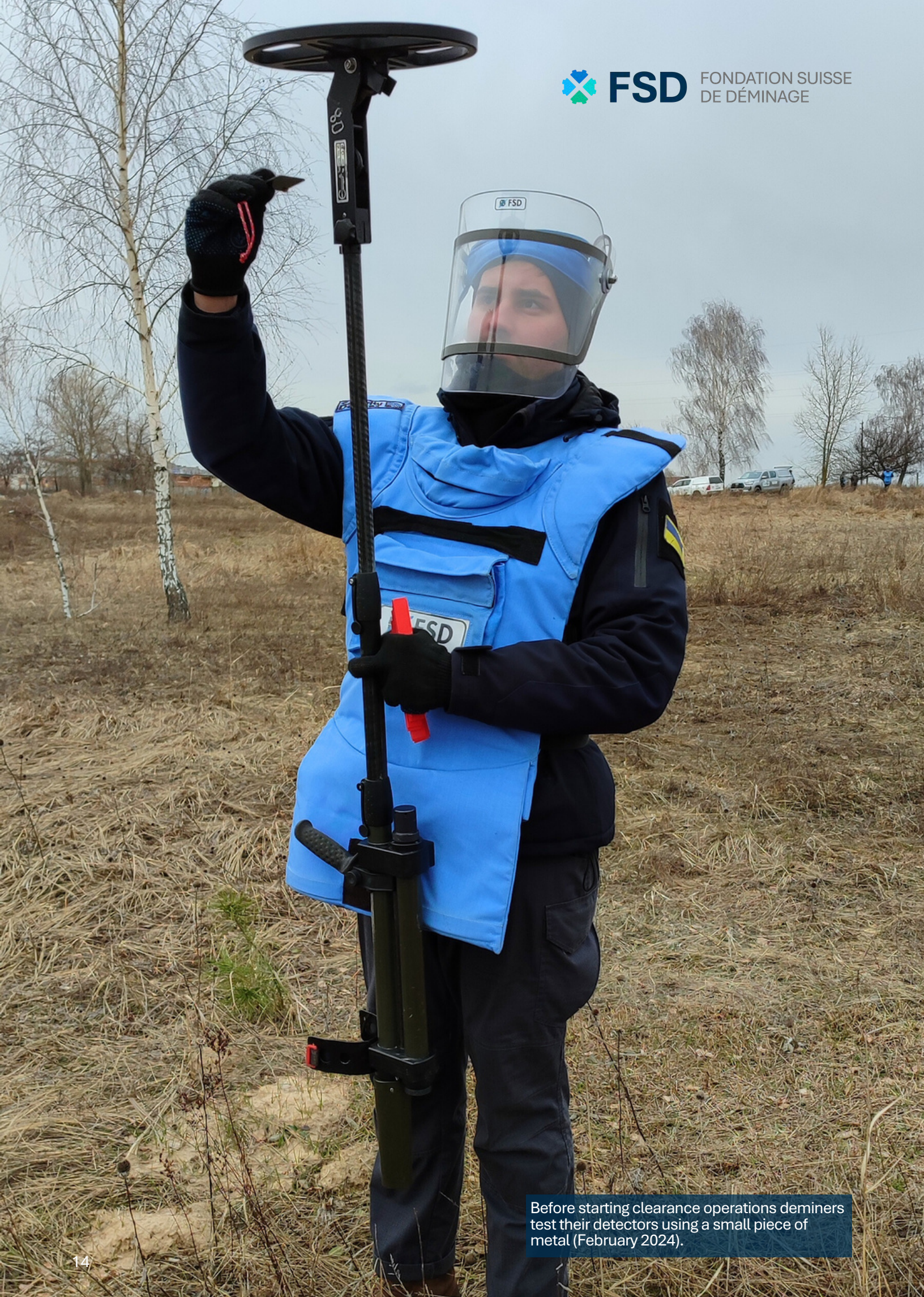
Before starting clearance operations deminers test their detectors using a small piece of metal (February 2024).