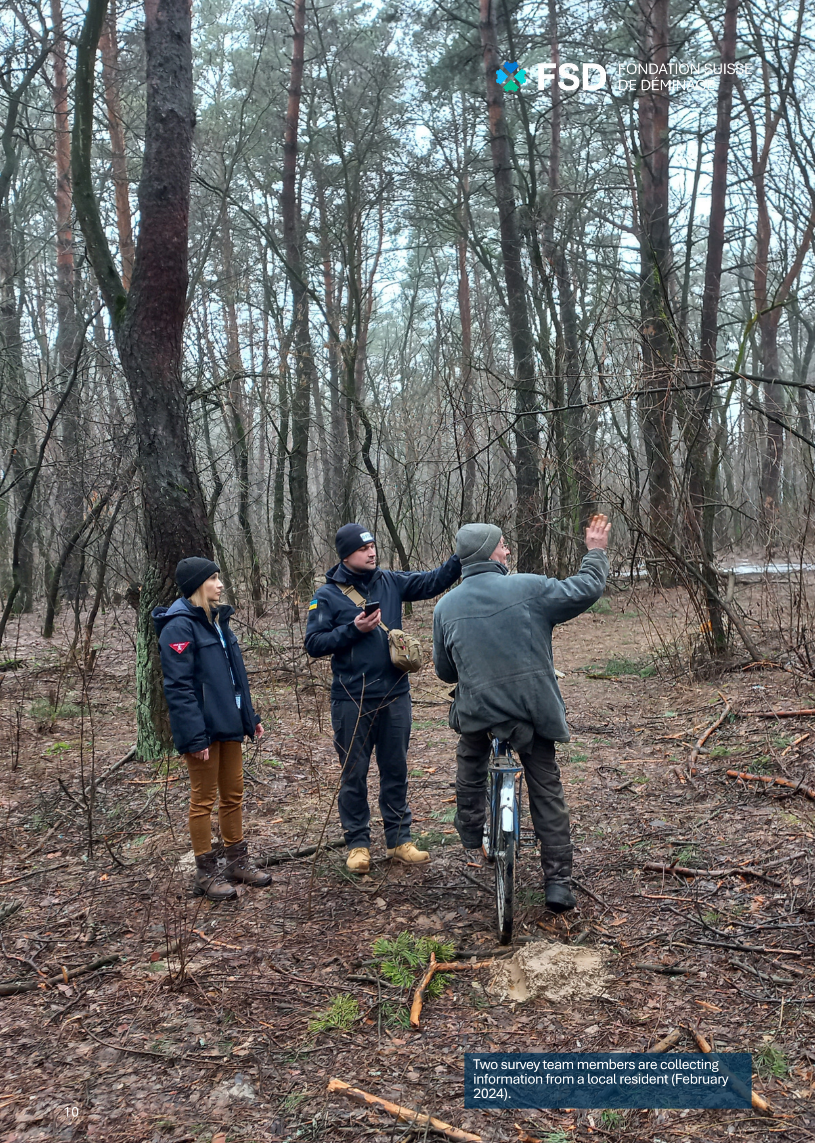
Two survey team members are collecting information from a local resident (February 2024).