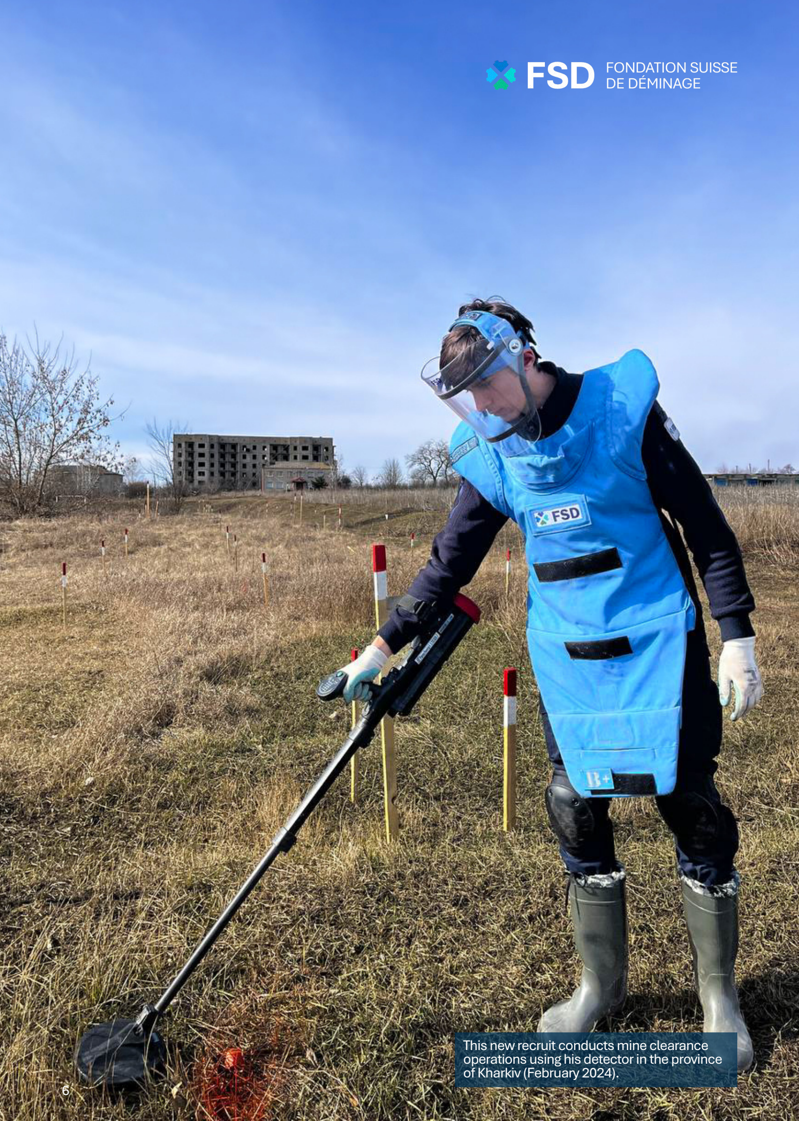
This new recruit conducts mine clearance operations using his detector in the province of Kharkiv (February 2024).