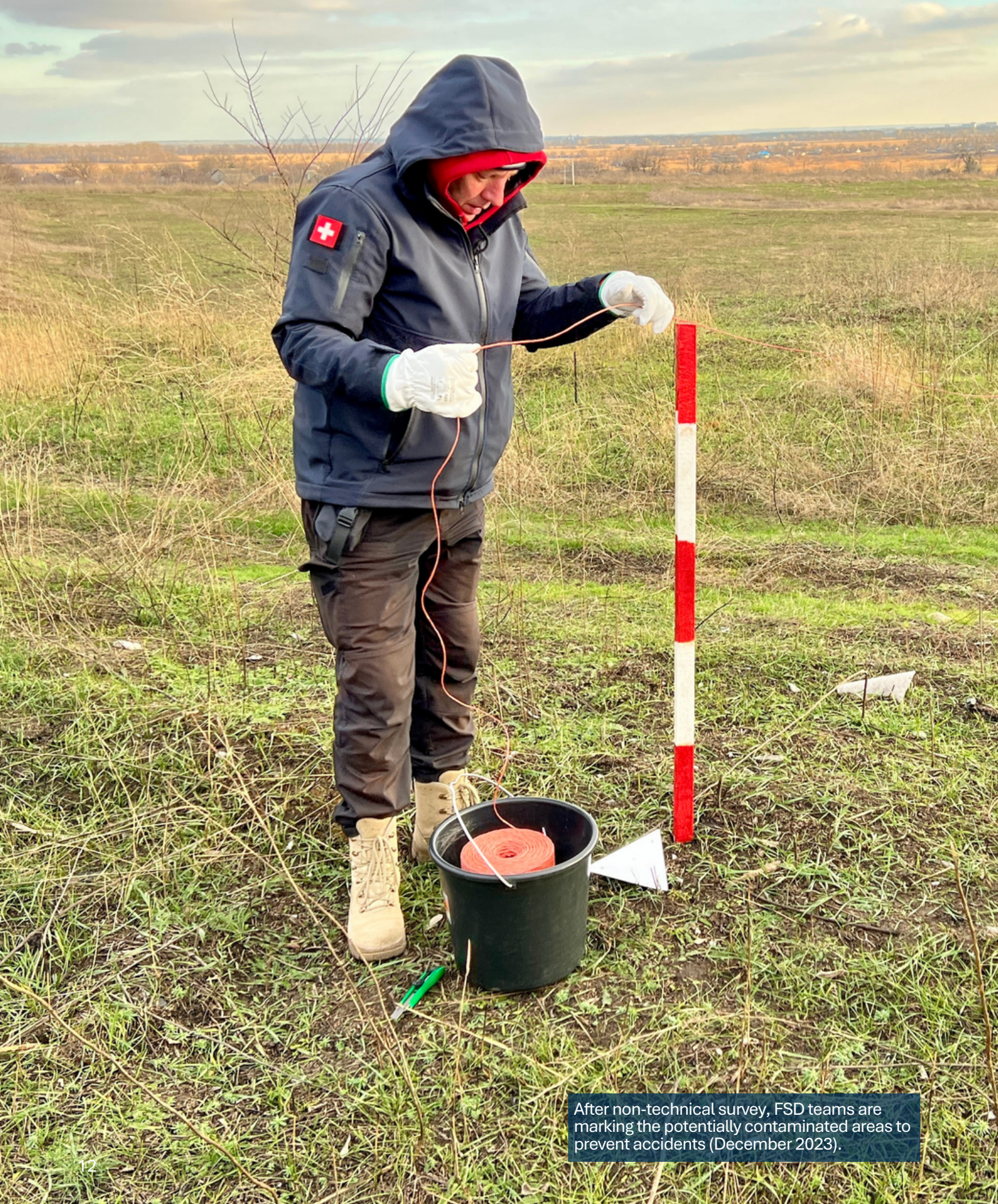
After non-technical survey, FSD teams are marking the potentially contaminated areas to prevent accidents (December 2023).