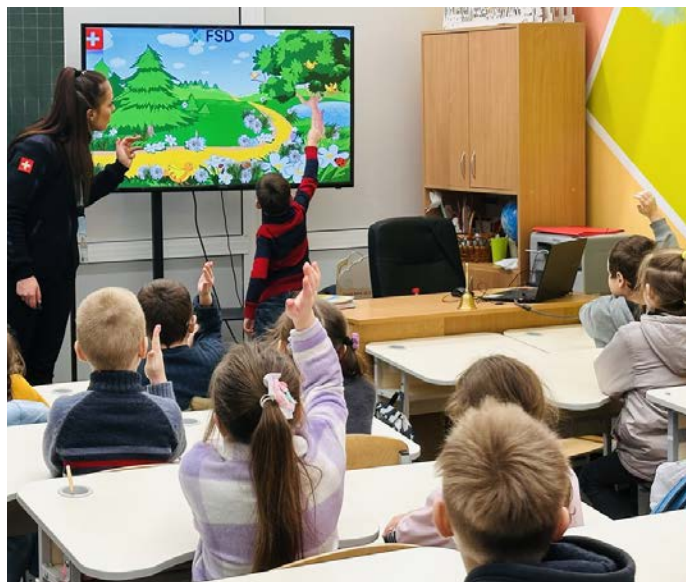
FSD teams provide risk education sessions to children in schools and villages (March 2024).