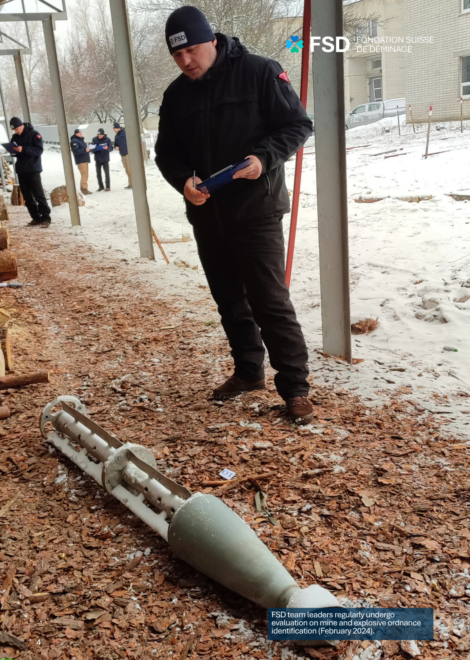
FSD team leaders regularly undergo evaluation on mine and explosive ordnance identification (February 2024).