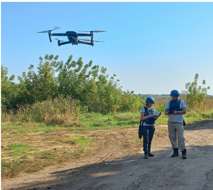
FSD staff member training on the use of drones for non-technical surveys (September 2023).

In 2023, FSD continued to strengthen its operational capacities through the recruitment and training of staff, as well as the acquisition of equipment.