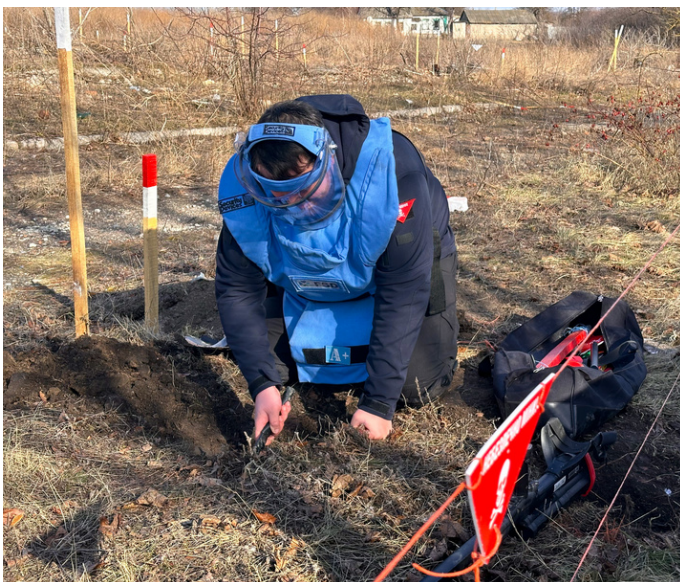
Mine clearance is a methodical task. Deminers examine the ground centimetre by centimetre (February 2024).

FSD Ukraine's operational budget for 2024 amounts to 32 million Swiss francs. Proposals are currently being examined by various institutional partners to expand our action and speed up demining in the country.