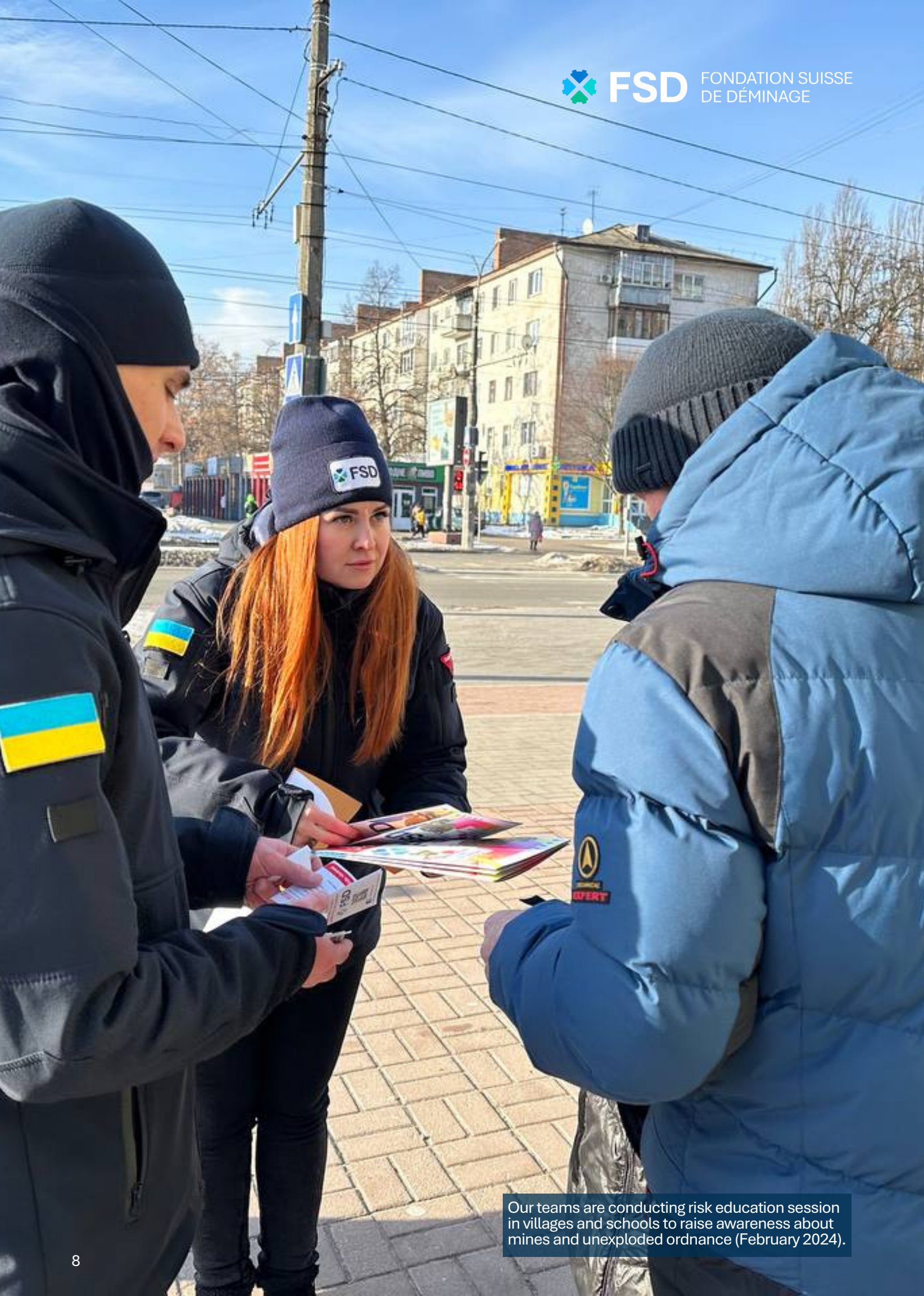
Our teams are conducting risk education session in villages and schools to raise awareness about mines and unexploded ordnance (February 2024).