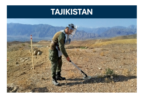
Survey · Mine clearance · Risk education · Environmental remediation