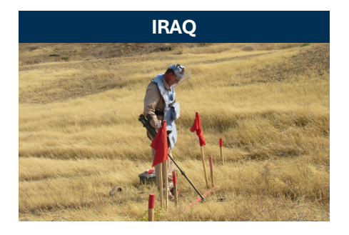
Survey \cdot Mine clearance \cdot Risk education