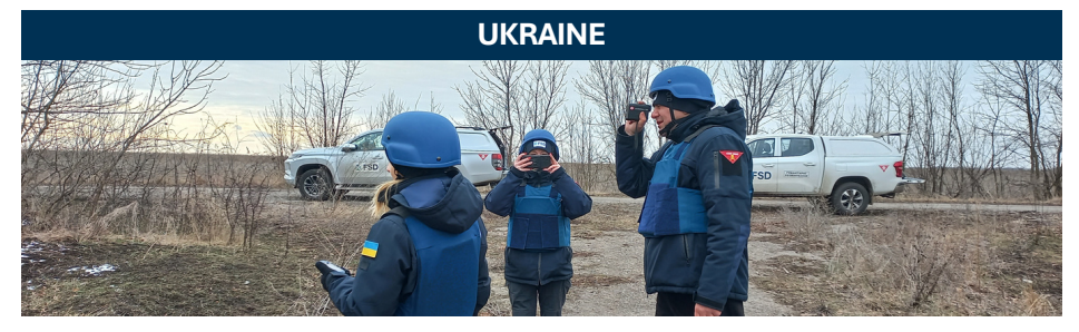
Survey · Mine clearance · Explosive ordnance risk education · Capacity building