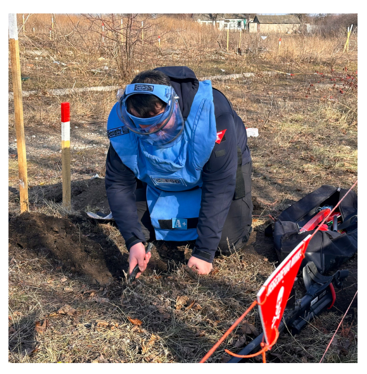
Mine clearance is a methodical task. Deminers examine the ground centimetre by centimetre (February 2024).

FSD Ukraine's operational budget for 2024 amounts to 35 million Swiss francs. Proposals are currently being examined by various institutional partners to expand our action and speed up demining in the country.