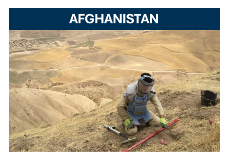
Survey \cdot Mine clearance \cdot Mine victim assistance