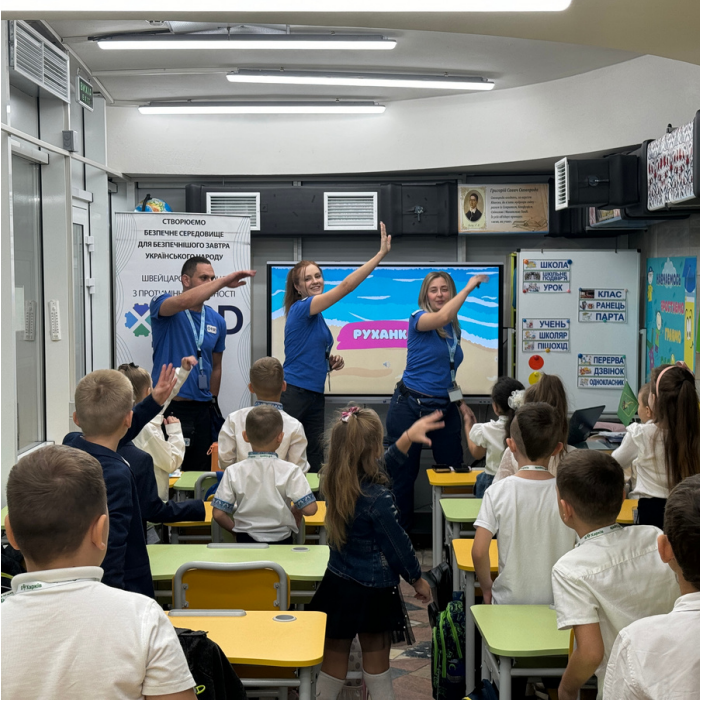
FSD teams provide risk education sessions to children in schools and villages (September 2024).