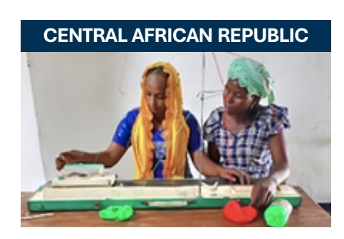
Support to the peace process · Socio-economic support to communities