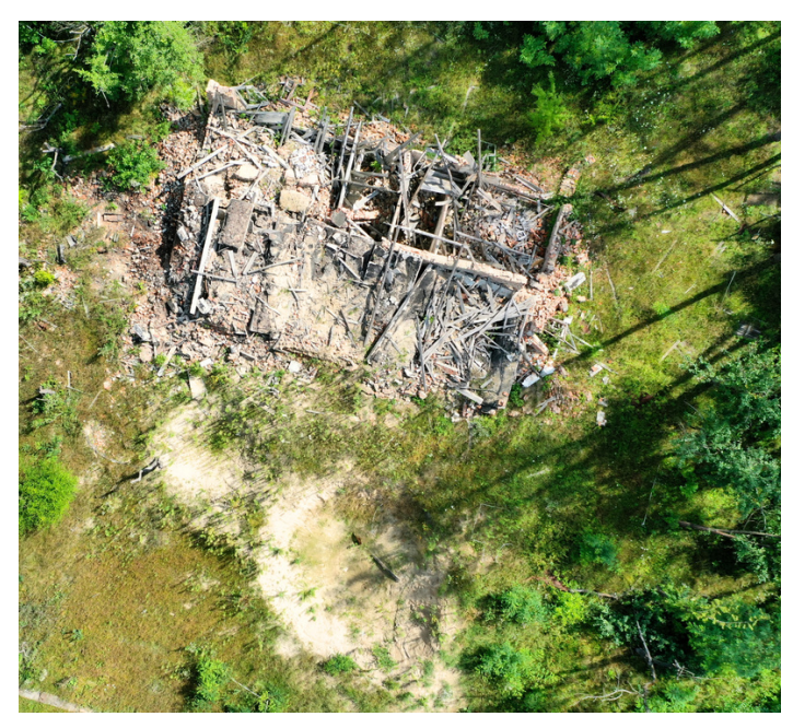
Aerial view taken by a drone showcasing a destroyed building during non-technical survey (July 2023).