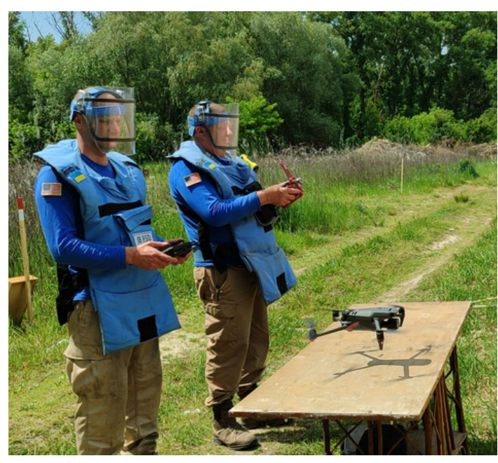
FSD staff member training on the use of drones for non-technical surveys (July 2024).

In 2023, FSD strengthened its operational capacities through the recruitment and training of staff and the acquisition of equipment. In 2024, two satellite operations offices were opened in Donetsk province and near Kryvyi Rih, to service the northeastern part of Kherson province.