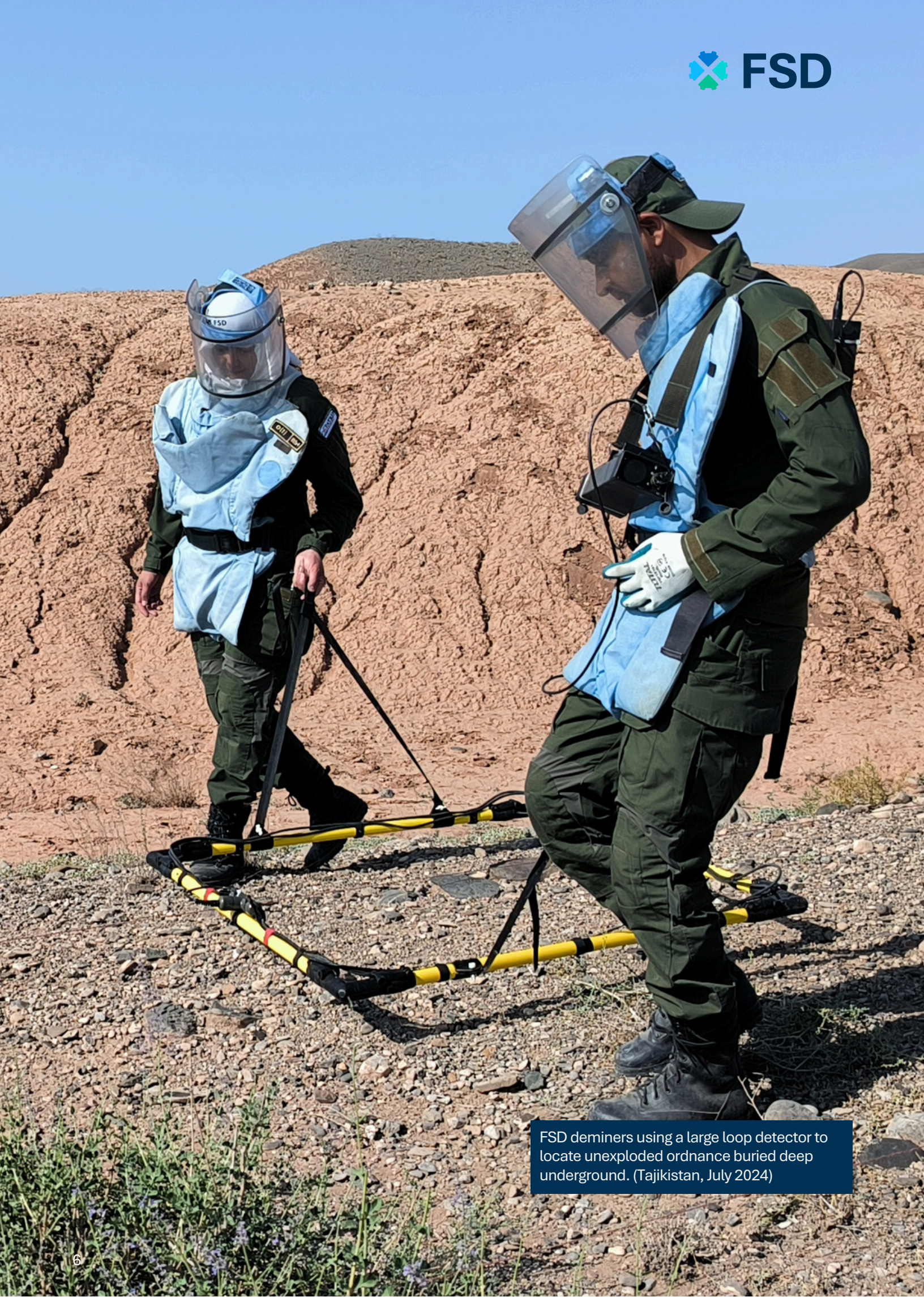
FSD deminers using a large loop detector to locate unexploded ordnance buried deep underground. (Tajikistan, July 2024)