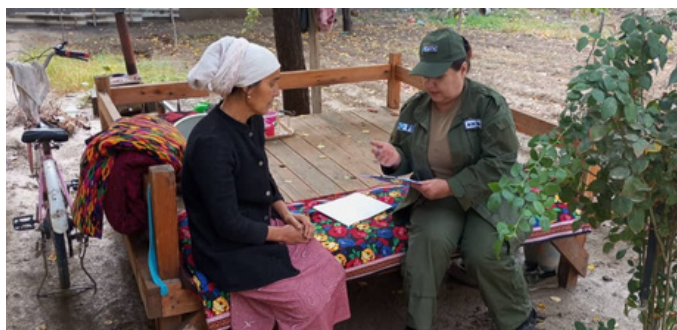
An FSD liaison officer conducting an interview to assess the socio-economic impact of mines and unexploded ordnance on communities. (Tajikistan, October 2024)

In 2023, with renewed funding, FSD relaunched its humanitarian demining programme along the Afghan border, expanding operations to new areas, including the Tajik-Uzbek and Tajik-Kyrgyz borders in the north. Efforts intensified in 2024, with additional demining teams recruited and deployed in the Sughd region. Risk education campaigns also resumed, equipping local communities with the knowledge to stay safe from explosive hazards.