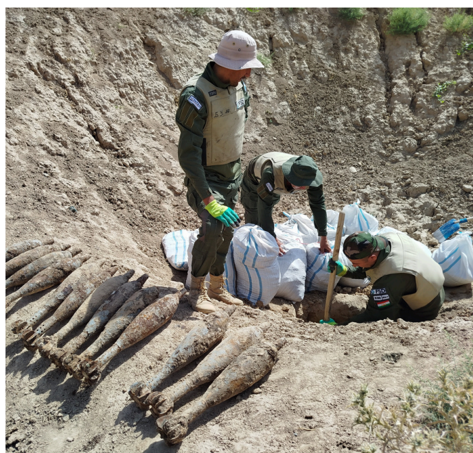
FSD team members preparing the controlled explosion of obsolete ammunition. (Tajikistan, September 2024)