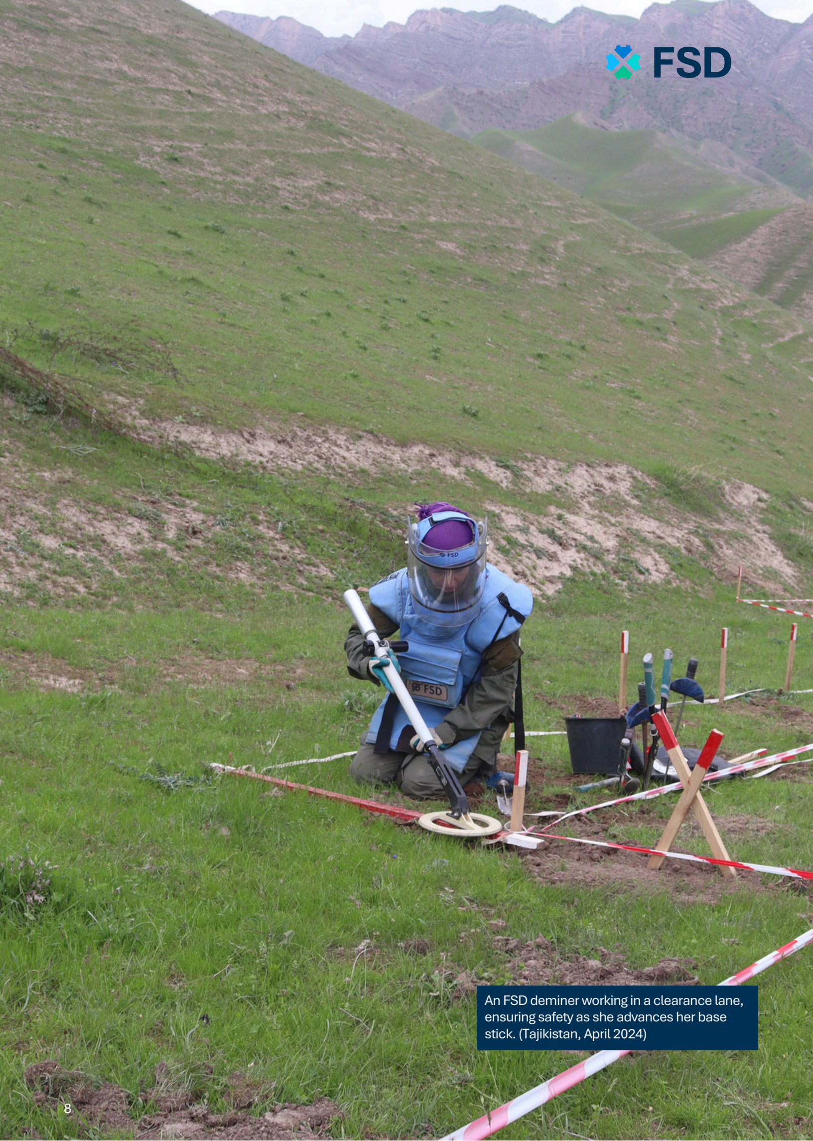
An FSD deminer working in a clearance lane, ensuring safety as she advances her base stick. (Tajikistan, April 2024)