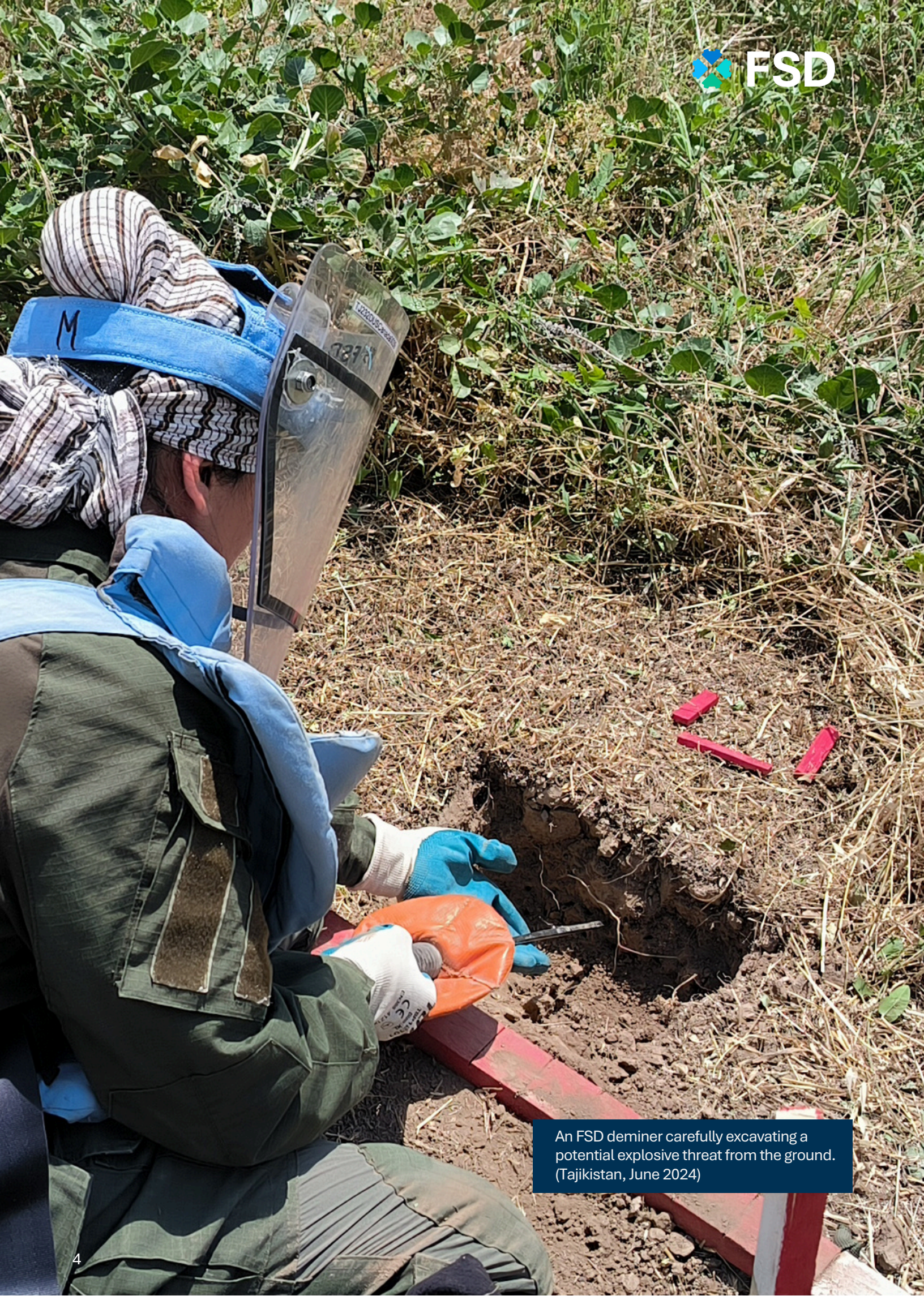
An FSD deminer carefully excavating a potential explosive threat from the ground. (Tajikistan, June 2024)