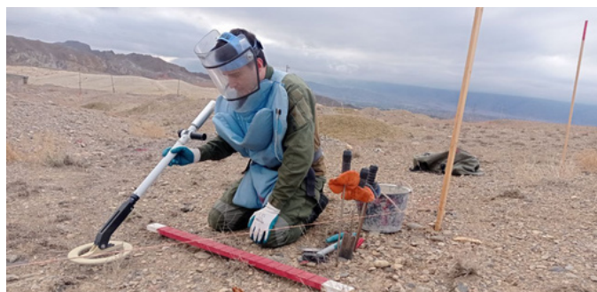
An FSD deminer carefully scanning the ground with his detector, looking for signals indicating the presence of buried explosive ordnance. (Tajikistan, October 2024)