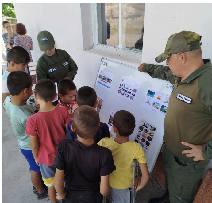
An FSD risk education team explaining the dangers of unexploded ordnance to a group of children. (Tajikistan, August 2024)

FSD’s mine clearance operations in Tajikistan are supported by the PATRIP Foundation and UK International Development, while our environmental initiatives receive funding from the Global Environment Facility (GEF) and private donors.